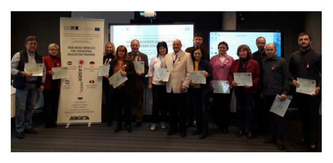
In the end of kickoff meeting project members recieved participation certificate